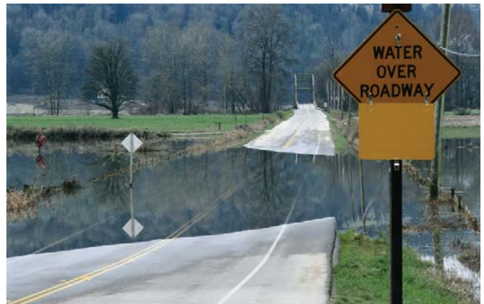
Biodiversity loss increases our vulnerability to natural disasters.

Over the last century, some people have benefited from the conversion of natural ecosystems and an increase in international trade, but other people have suffered from the consequences of biodiversity losses and from restricted access to resources they depend upon. Changes in ecosystems are harming many of the world's poorest people, who are the least able to adjust to these changes.