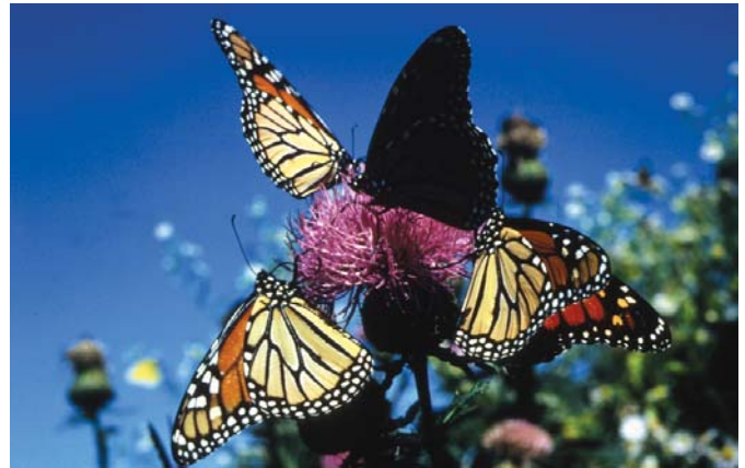
Biodiversity includes all organisms, from bacteria to complex animals.

Strong institutions at all levels are essential to support biodiversity conservation and the sustainable use of ecosystems. International agreements need to include enforcement measures and take into account impacts on biodiversity and possible synergies with other agreements. Most direct actions to halt or reduce biodiversity loss need to be taken at local or national level. Suitable laws and policies developed by central governments can enable local levels of government to provide incentives for sustainable resource management.