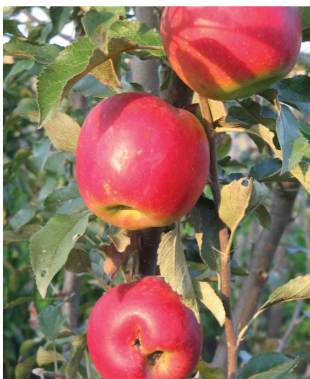
Biodiversity provides services and raw materials for human well-being.

In 2002, the Parties to the Convention on Biological Diversity agreed on a target to achieve a “significant reduction of the current rate of biodiversity loss at the global, regional, and national level as a contribution to poverty alleviation and to the benefit of all life on earth” by 2010.